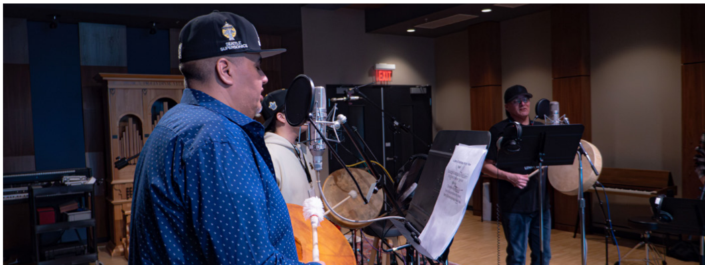
2024 OHSOTO'KINO Recording Bursary recipients, Warscout, recording in NMC's studios.

National Music Centre's OHSOTO'KINO initiatives at Studio Bell are made possible by support from TD.