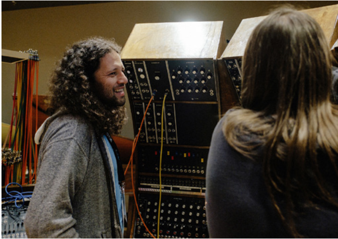
Artist in Residence nēhiyawak in NMC's recording studios.