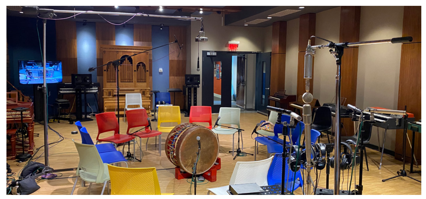
Northern Cree's set up to record in NMC's studios.