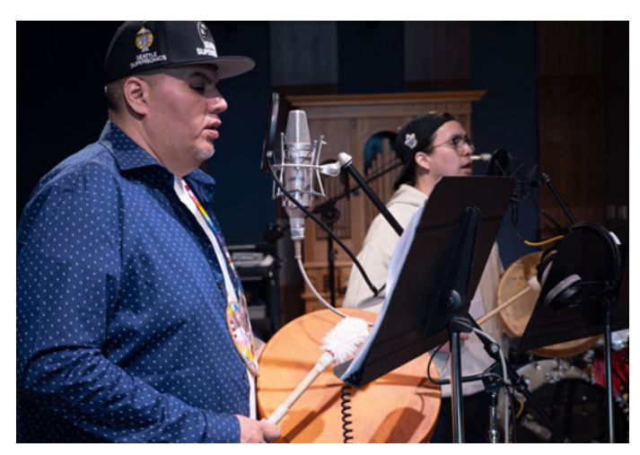
OHSOTO'KINO Recording Bursary recipients, Warscout.