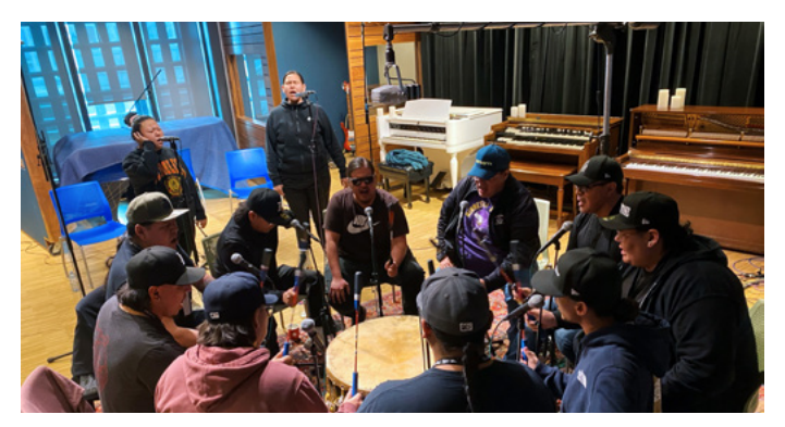
OHSOTO'KINO Recording Bursary participants the Blackstone Singers in NMC's recording studios.