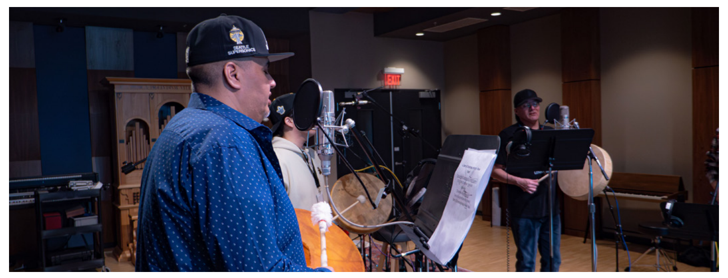
2024 OHSOTO'KINO Recording Bursary recipients, Warscout, recording in NMC's studios.

National Music Centre's OHSOTO'KINO initiatives at Studio Bell are made possible by support from TD.