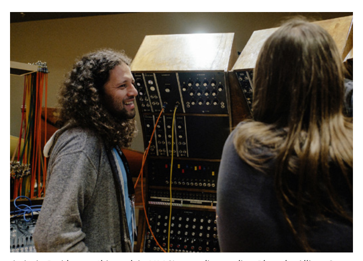
Artist in Residence nêhiyawak in NMC's recording studios.