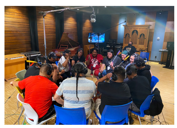
Northern Cree recording in NMC's studios.