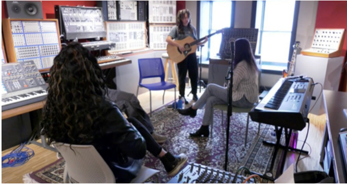
2024 Music Incubator artists at work in NMC's studio.