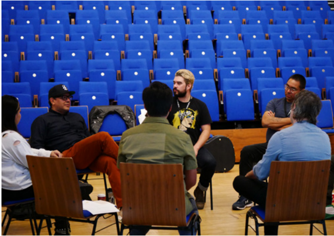
2022 OHSOTO'KINO Music Incubator participants.