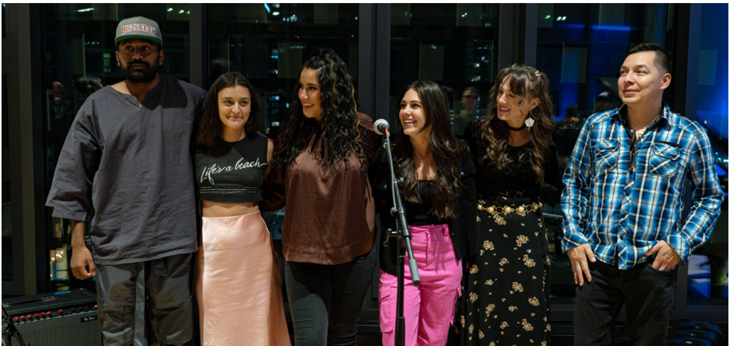
2024 OHSOTO'KINO Music Incubator artists.

NATIONAL INDIGENOUS PROGRAMMING ADVISORY COMMITTEE